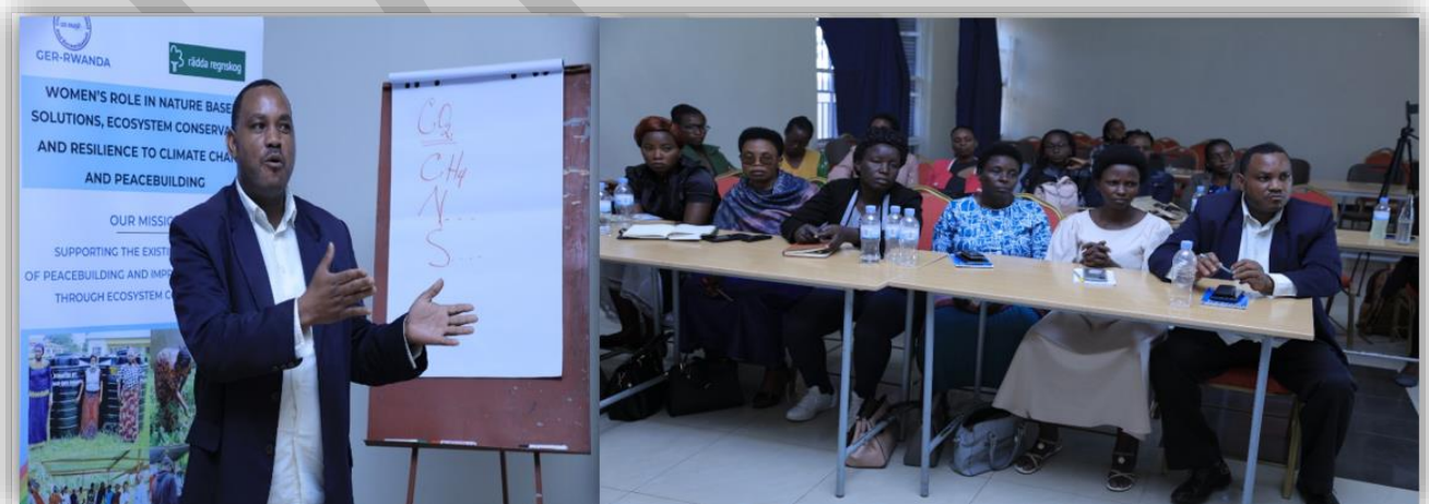
Above: Community team leader discussing some points with the participants